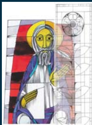
Sketch of stained glass image to be included in new church.

For more information on what items are still available and how to donate them, please contact Fr. Schillinger at 404-636-1418.